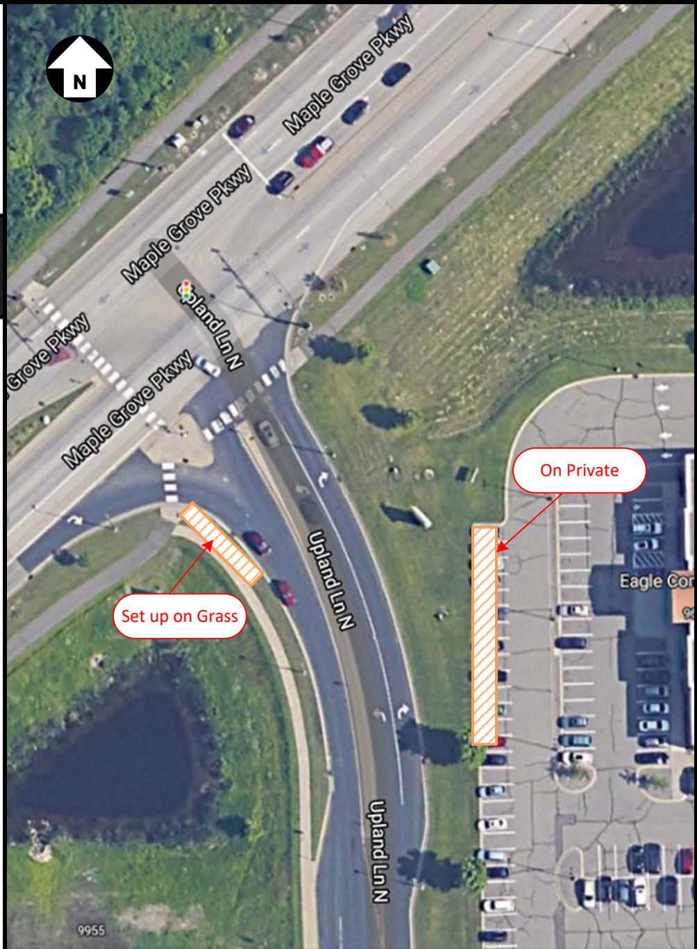
Upland Ln N