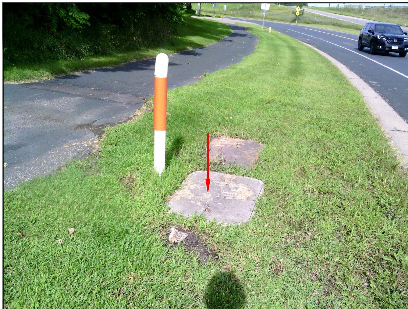
Existing Zayo Vault