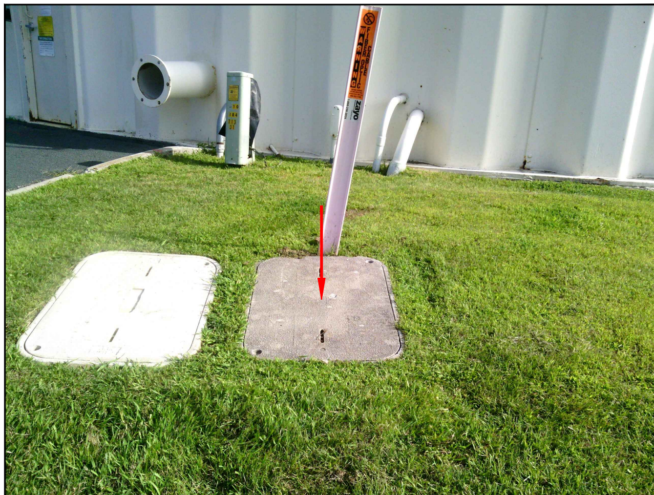
Existing Zayo Vault