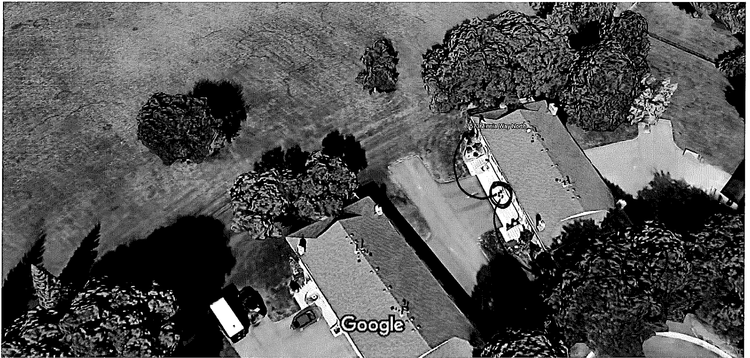
Imagery ©2019 Google, Map data ©2019 20 ft