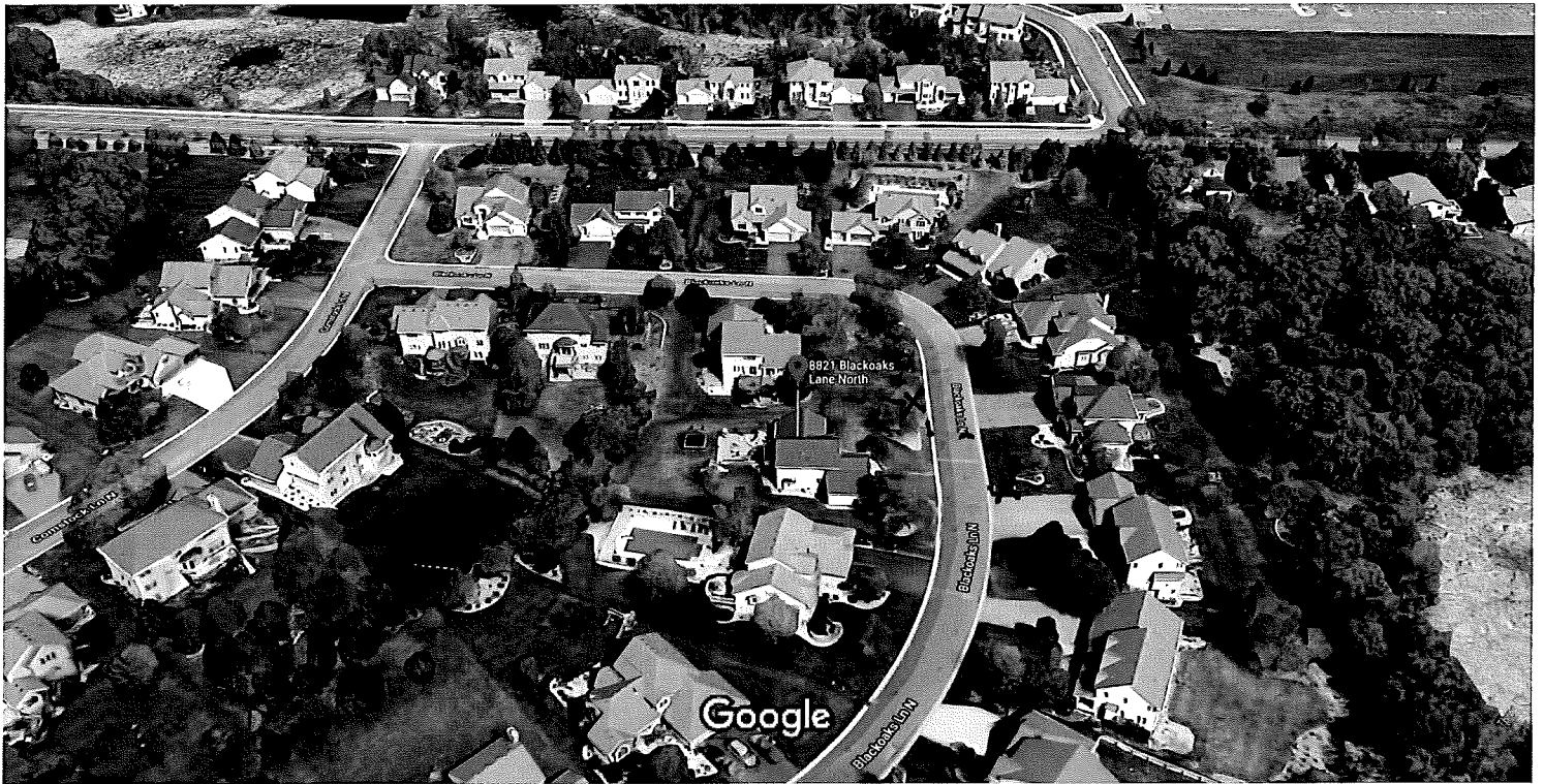
Imagery ©2019 Google, Map data ©2019 50 ft